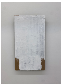
Untitled, 2022 Wood, cardboard, paper, black/white digital print on paper, acrylic and sellotape 31,5 x 57 cm