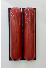
Clodagh 2, 2022

Wood, cotton, resin, polyurethane, black/white digital print on paper and wood stain 52 x 103 x 15 cm