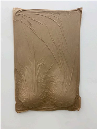
Untitled, 2022 Wood, cotton, resin, polyurethane, black/white digital print on paper and wood stain 185 x 122 x 17 cm