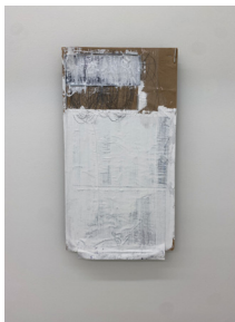
Untitled, 2022 Wood, cardboard, paper, black/white digital print on paper, acrylic, sellotape, epoxy, nails and pencil 31,5 x 59 cm