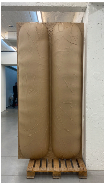
In Bulge, 2022

Wood, cotton, resin, polyurethane, black/white digital print on paper and wood stain 52 x 103 x 15 cm