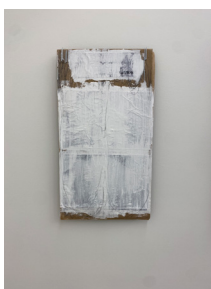
Untitled, 2022 Wood, cardboard, paper, black/white digital print on paper, acrylic, sellotape, epoxy, nails and pencil 31 x 58 cm