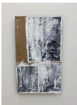
Chris , 2022 Wood, cardboard, paper, black/white digital print on paper, acrylic, sellotape, epoxy and nails 41 x 69,5 cm