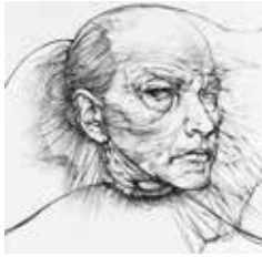
Hans Bellmer Self-Portrait , 1969 drypoint 65 x 49,5 cm edition of 70