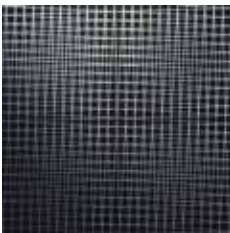
François Morellet Superposition de 2 Trames de Carrés , 1971 silver silkscreen 59,8 x 58,8 cm edition of 180