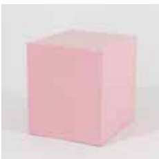
John McCracken Pink Cube , 1968 Polyester resin, fiberglass and plywood 25,4 x 25,7 x 21,9 cm