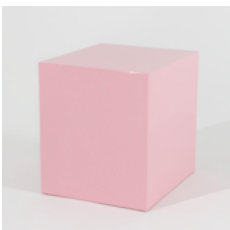
John McCracken Pink Cube , 1968 Polyester resin, fiberglass and plywood 25,4 x 25,7 x 21,9 cm