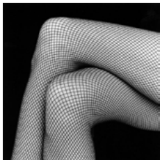
Robert Mapplethorpe Legs / Melody , 1987 gelatin silver print 60,2 x 50,5 cm 1/2 AP