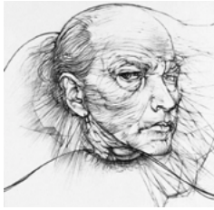
Hans Bellmer Self-Portrait , 1969 drypoint 65 x 49,5 cm edition of 70