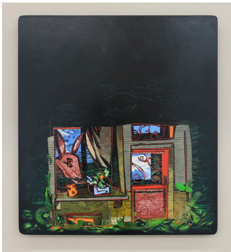
Het Hier en Nu , 2024-25 Oil on panel 60 x 54 cm