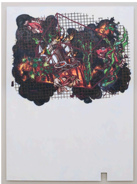
The Inside-Out , 2024-25 Oil on panel 160 x 115 cm