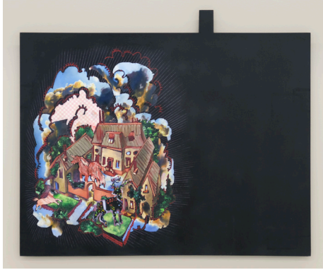
The Heavens , 2024-25 Oil on panel 70 x 90 cm