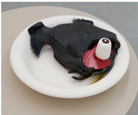
Beauty , 2015 Impact metal, plaster, oil paint, wax and ecoline Dia. 46 cm