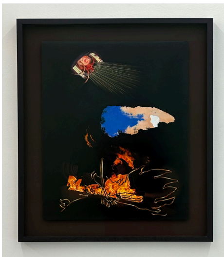
De Grot , 2008 Oil on panel 90 x 77 cm