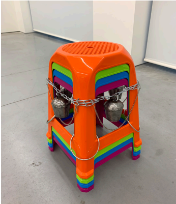
Ria Pacquée Bad Spirit Chaser II , 2024 Plastic and metal 55 x 36 x 37 cm