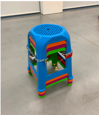
Ria Pacquée Bad Spirit Chaser III , 2024 Plastic, metal, cord 55 x 35 x 37 cm