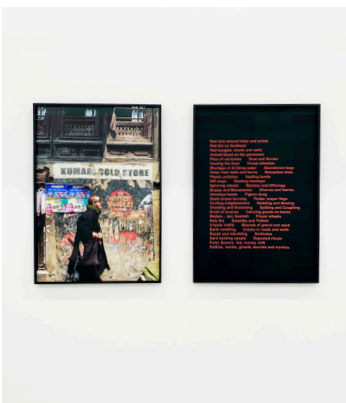
Ria Pacquée Street Rambling Kathmandu , 2024 Silkscreen, color photo print Dyptich (Framed, each 101.5 x 71.5 cm)