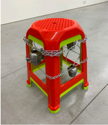
Ria Pacquée Bad Spirit Chaser I , 2024 Plastic and metal 49 x 35 x 36 cm