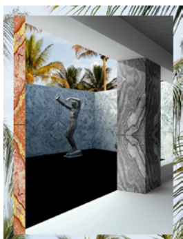
6 The Plastic Number (Barcelona) , 2017 Baryta inkjet prints, pins 46.7 x 61,6 x 3 cm (framed) Unique